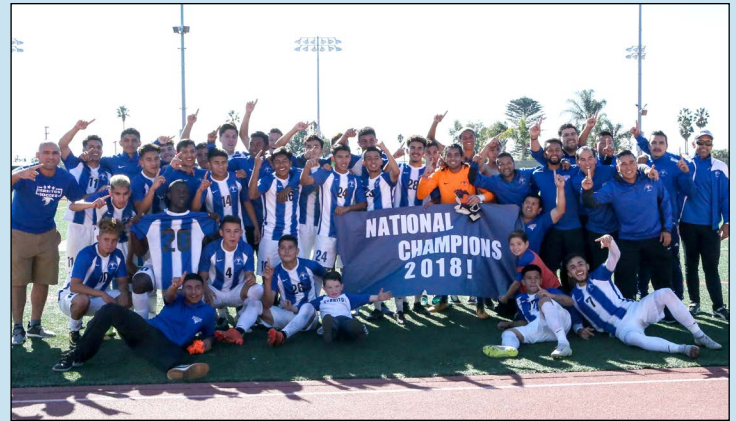
Men's soccer team earned its first national championship