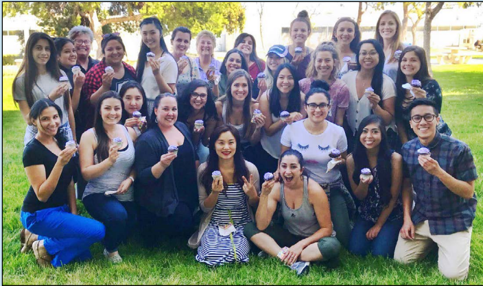
The 2018 dental hygiene class earned a 100% passage rate on the National Board exam