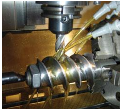
Machined from a blank of 304 stainless steel, this constant pitch screw was programmed using GibbsCAM's Advanced Rotary.

As a smaller shop, being able to handle a wide range of jobs helps Tom's Machining Service win more work. One of the company's regular customers makes sculptures for museums. They are usually made out of stainless steel, and some of the components are put together mechanically, such as the base, threads, pipes, and other apparatus.